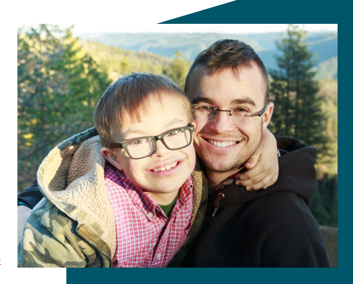
Every caregiver's hope is for their child to get well.

Every caregiver's hope is for their child to get well. At the same time, it is important to consider the child's overall well-being when dealing with a life-limiting prognosis. Hospice care is focused on